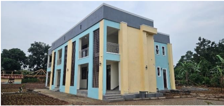
The realised Vision 2025 - extension building